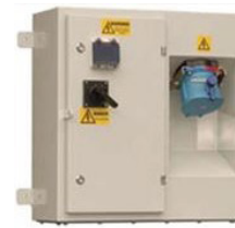
Norm connection plug

Please note: A stable electric power supply meeting above specifications must be provided by the customer for the whole rental.