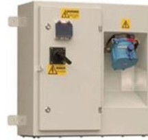
Norm connection plug

NOTE: A stable electric power supply meeting above specifications must be provided by the customer for the whole rental.