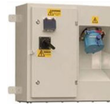
Norm connection plug

Please note: A stable electric power supply meeting above specifications must be warranted for the whole rental. Cable protective ramps or catenary systems shall be provided by the Client where cables traverses roads or pathways.